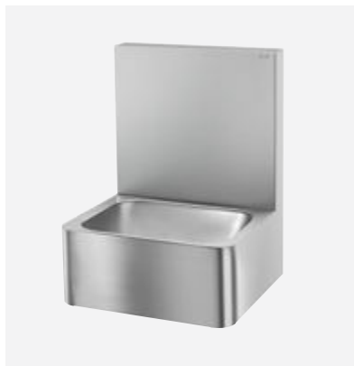
Hygiene washbasin in stainless steel Ref. DELABIE: 188000

Images available on our website delabie.com , in the PRESS section